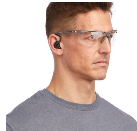
Talk Through Your Ears® In-Ear Communication System