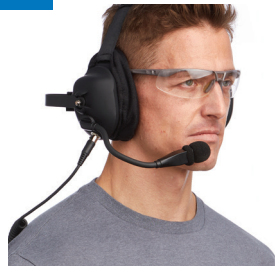
Classic™ Heavy Duty Headset