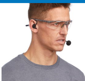
Phantom™ Lightweight Headset