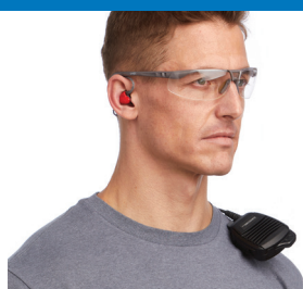
RadioGear® + Alpha™ Earset with Speaker Mic